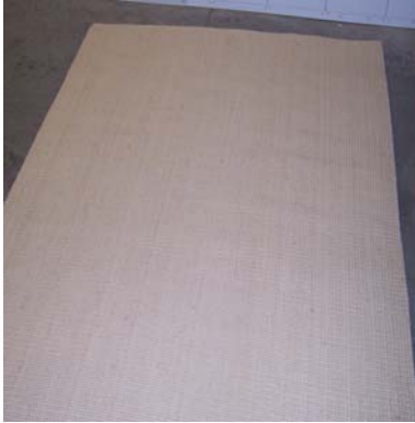
Wool Jute Rug 5 x 8

Starting Bid: $40.00 Retail Price: $149.00