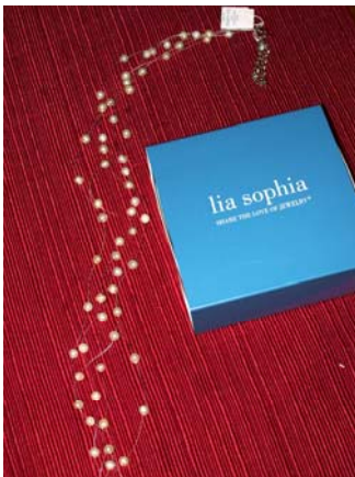
Lia Sophia, Pearlette Necklace Genuine Freshwater Pearls, 15-18"

Starting Bid: $25.00 Retail Price: $74.00