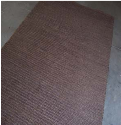
Colorbound Chenille Espresso Rug 5 x 8

Starting Bid: $40.00 Retail Price: $149.00