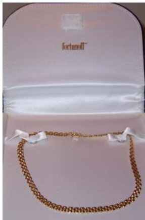
Fortunoff Gold Braided Chain

Starting Bid: $20.00 Retail Price: $86.00