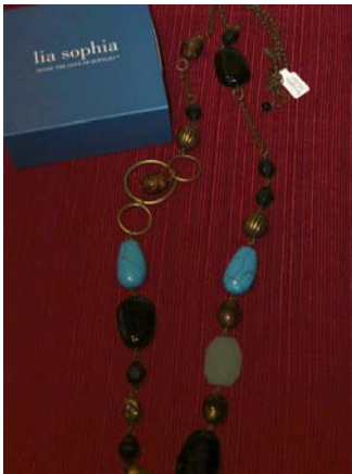
Lia Sophia, Lagoon Genuine Turquoise with Glass and Resin Beads.

Starting Bid: $80.00 Retail Price: $235.00