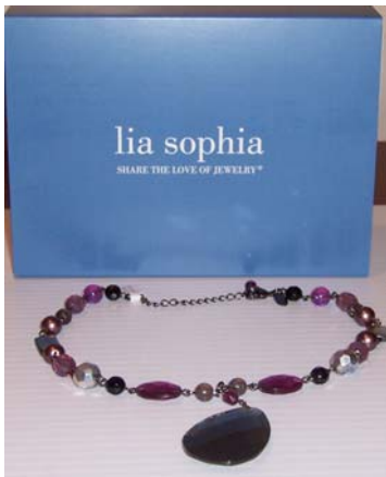
Lia Sophia, Berrylicious Glass and Resin Beads Necklace. 16-19".