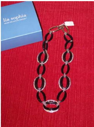
Lia Sophia, Jet Resin and Crystals Cut crystals, 17" Necklace

Starting Bid: $80.00 Retail Price: $235.00