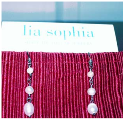
Lia Sophia, Pearlette Pierced Earrings. Genuine Freshwater Pearls.

Starting Bid: $10.00 Retail Price: $28.00