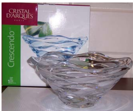
Cristal D'Arques Crescendo Crystal bowl 30cm, 11 3/4

Starting Bid: $20.00 Retail Price: $60.00