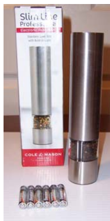
Slim Line Professional Electronic Peppermill By Cole & Mason. Stainless steel peppermill with built in light. Peppercorns and batteries included.

Starting Bid: $20.00 Retail Price: $60.00