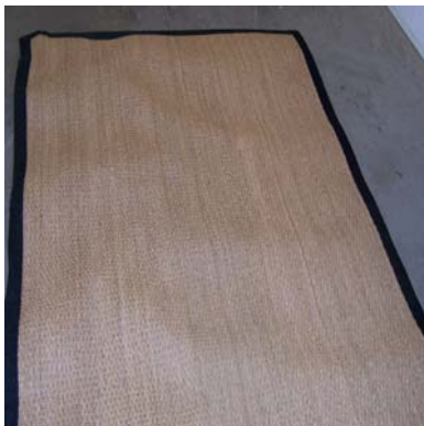
Henley Taupe 5 x 8

Starting Bid: $140.00 Retail Price: $399.00