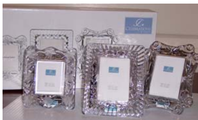
Mikasa Celebrations Picture Frames Set of three assorted crystal frames.

Starting Bid: $20.00 Retail Price: $60.00